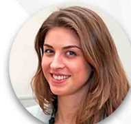
Ла Тойя Ваха

A scientific and practical conference was held on “The experience of the Central Asian countries and the EU in rehabilitation and reintegration of repatriates”.